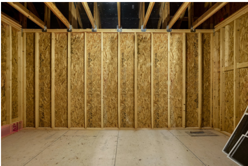
Upstairs the spacious bonus room is perfect for an office, game, play, or media room. Upstairs also offers a great unfinished storage space for all your seasonal items.